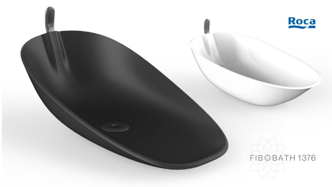
Example of .jpg file: